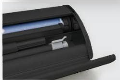
Pole can be stored in the base of the Roll Up