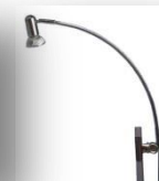
LED or Spotlight