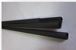
Pole in three parts

This Lux Roll Up features a "field-serviceable" graphics cartridge. Like other Roll Up banner stands, this banner stand, retracts the banner into the base when not in use. The difference is that this product offers an interchangeable graphic cartridge. In less than 5 minutes, your customer can change his trade show banner display to feature a new message. This offers your customer the possibility to buy several graphics and change them during an exhibition.